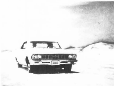
29. Ready to go now.