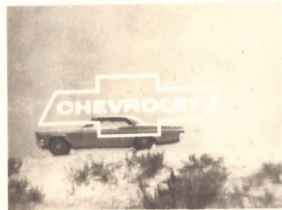
15. May we build one just for you? See your Chevrolet dealer, now! (Music button.)