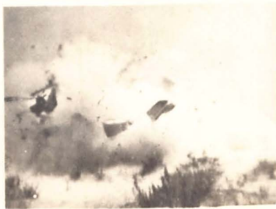
14. Chevrolet is building a lot of exciting cars this year.