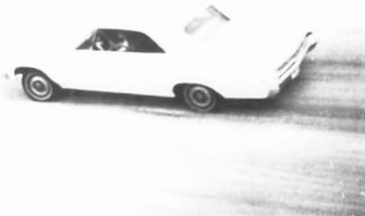
28. Check out the Chevelle Malibu Sport Coupe. Sleek sensation for 1966.