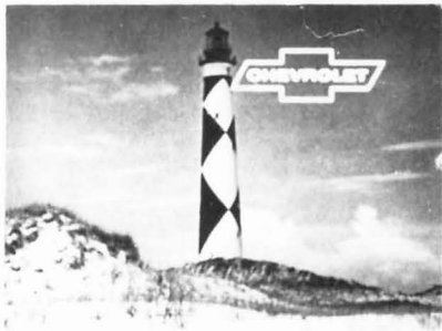
30. At your Chevrolet dealers.